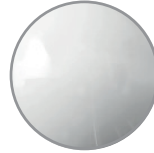
SATIN WHITE Powdercoat