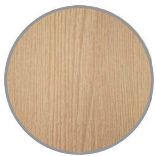
CLEAR COATED American Oak