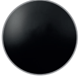
BLACK ACE Powdercoat