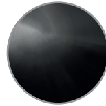
SLATE BLACK Brass Patina